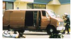
Jonathan Gold: L.A. riots, a culinary upheaval