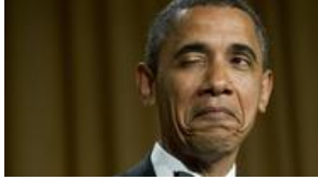
Obama, Kimmel's jokes from Correspondents' Dinner