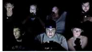
Texting allowed at the movies? SMH