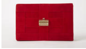
Photos: Mother's Day gift guide