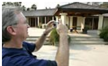
Another way the rich are different: 'concierge-level' fire protection